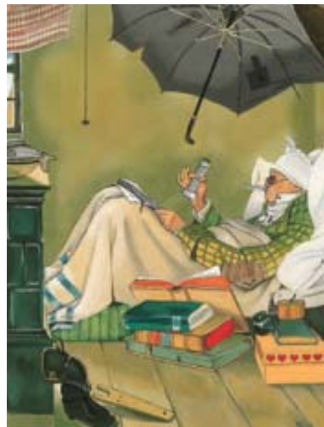
Carl Spitzweg - "The Poor Poet" (detail)

There are always some deviations from these standards on the market and particularly in the case of the larger size brushes this will be reflected in remarkable price differences. Never buy a brush size 'blind', check, for example, whether size 12 compares with the size reproduced below.